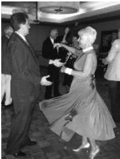
Those Big Band Tunes and wonderful dancers made Serenade special!